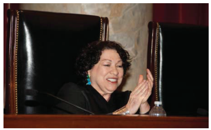
At the conclusion of the "oral argument", Justice Sotomayor applauded the two advocates for their presentations.

came before her in which team owners were accused of colluding illegally to fix the salaries of baseball players. The dispute threatened to delay the opening of the season that year. In her decision on the case, then-judge Sotomayor agreed that the team owners were colluding, and she granted a temporary injunction that barred them from the practice, opening the way for the season to begin on schedule. Her timely action not only earned her the nickname, but also the good will of millions of baseball fans.